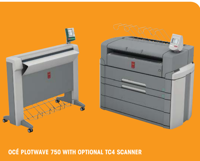
Océ PLOTWAVE 750 WITH OPTIONAL TC4 SCANNER

Meet short deadlines and work efficiently with the instant-on performance of Océ Radiant Fusing technology. Get over 27 D-size (A1) size prints, before others have even started printing and consistently turn out 9 D-size (A1) prints per minute, even with mixed sizes. With 6 media rolls, the Océ Double Decker Pro stacker and built-in cutters, you can print and stack up to 3,444 feet (1,050 meters) of output without interruption. Scan and copy as-builts, color markup and other technical documents in one quick and easy step for immediate archiving and distribution.