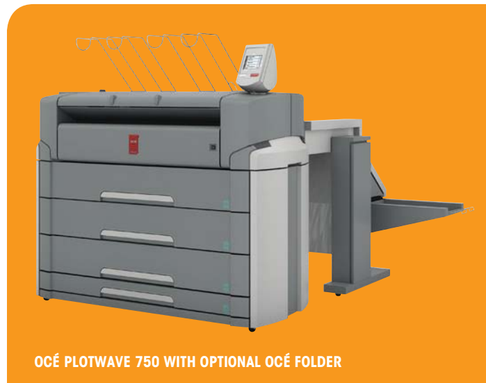
Océ PLOTWAVE 750 WITH OPTIONAL Océ FOLDER