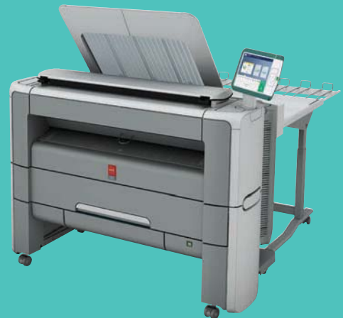
WITH OPTIONAL REAR DELIVERY TRAY