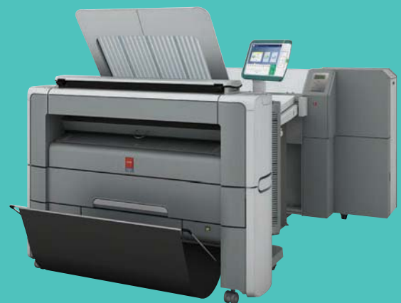
WITH OPTIONAL OCÉ ESTEFOLD 4312 FOLDER AND EXTENDED STACKER