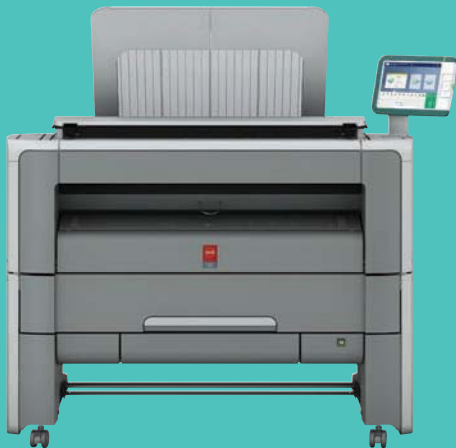
WITH OPTIONAL SCANNER EXPRESS II

You can access your projects' documents directly at the printer using the Océ ClearConnect multi-touch user panel. Are your files on a USB stick, on a network location or in the cloud? Just browse and swipe to your files and print them. In addition, you can scan directly to virtually unlimited destinations in the cloud or your Intranet. When you have a file on your iPad® mobile device, just use the WiFi infrastructure of your company to access the Océ PlotWave 340/360 printer and print via the Océ Publisher Mobile app. Or print from your desktop PC via Océ Publisher Select™ software to manage more complex document sets.