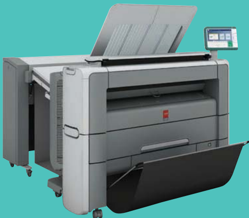
WITH OPTIONAL OCÉ ESTEFOLD 2400 FANFOLD