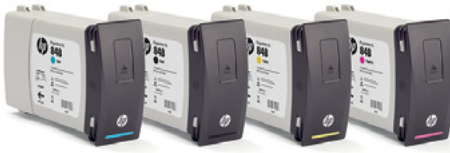
8 HP PageWide XL ink cartridges (2 x 400-ml per color with auto-switch)

The HP PageWide XL 5000 Printer series includes a stationary 40-inch (101.6-cm) printbar that spans the whole printing width. As paper moves under the printbar, the entire page is printed in one pass, enabling very high printing speeds.