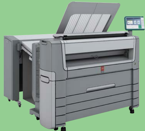
MULTIFUNCTION SYSTEM WITH OPTIONAL OCÉ 2400 FANFOLD