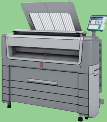
WITH OPTIONAL SCANNER EXPRESS II (MULTIFUNCTION SYSTEM)

Being able to submit files to your large format printer from anywhere can give you a big advantage when time is tight and deadlines are looming. The Océ ClearConnect software suite gives you more flexible ways to submit files to the printer. Print from your desktop via Océ Publisher Select™ software to manage complex document sets. With Océ Publisher Mobile, print from your smartphone or tablet when you are rushing to a meeting. Knowing you can print when you need to, can take some of the stress out of your work day.