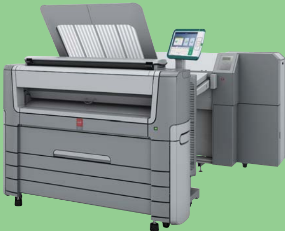
MULTIFUNCTION SYSTEM WITH OPTIONAL OCÉ 4312 FULLFOLD