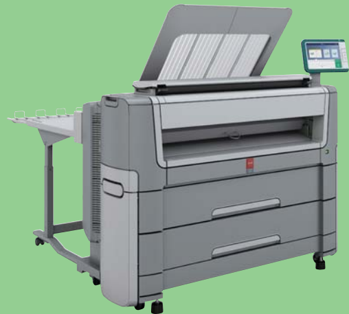
MULTIFUNCTION SYSTEM WITH OPTIONAL OCÉ DELIVERY TRAY AND OPTIONAL MEDIA DRAWER